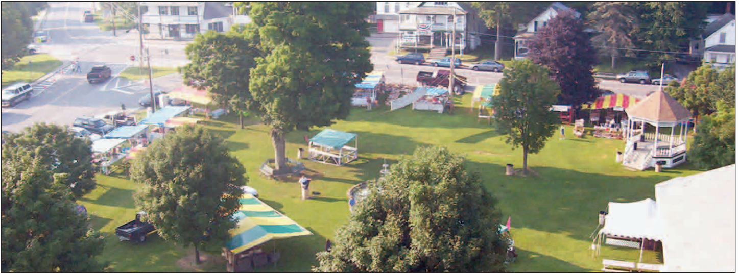
Sunrise preparations for Fair Day on the Townshend Common. This year's fair will be Saturday, August 7.

T ransparency is in. The government wants transparency for the banks. The people want transparency in government. Well, without any prodding, the Hospital Auxiliary will let it all hang out!